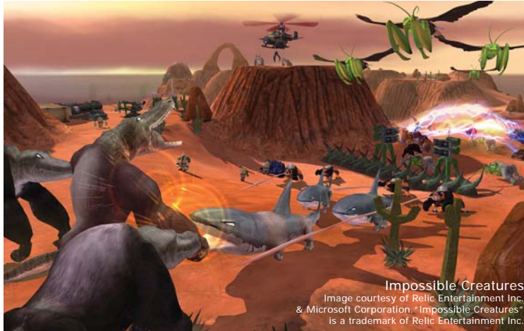
Impossible Creatures "Impossible Creatures" is a trademark of Relic Entertainment Inc.