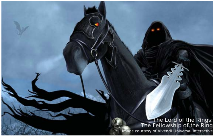
The Lord of the Rings: The Fellowship of the Ring