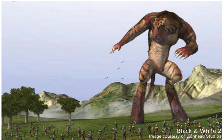
Black & White 2